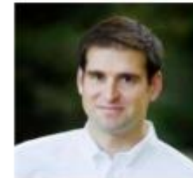
Jeffrey Brian "JB" Straubel is part of the founding team and the Chief Technical Officer of Tesla Motors

He is the founder, CEO and CTO of SpaceX; co-founder, CEO and product architect of Tesla Motors; co-founder and chairman of SolarCity, co-chairman of OpenAI; co-founder of Zip2; and co-founder of PayPal. As of June 2016, he has an estimated net worth of US$12.7 billion, making him the 83rd wealthiest person in the world