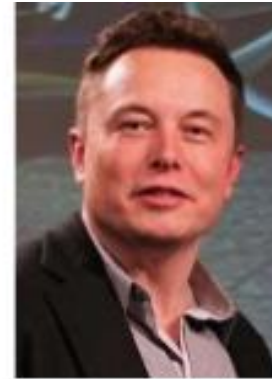
Elon Reeve Musk is a South African-born Canadian-American business magnate, engineer and inventor